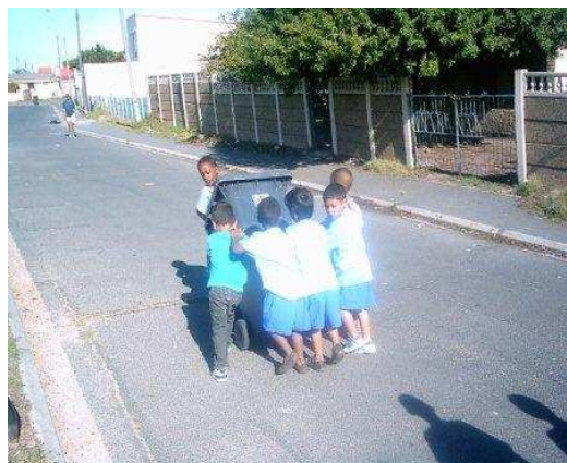
On their way...