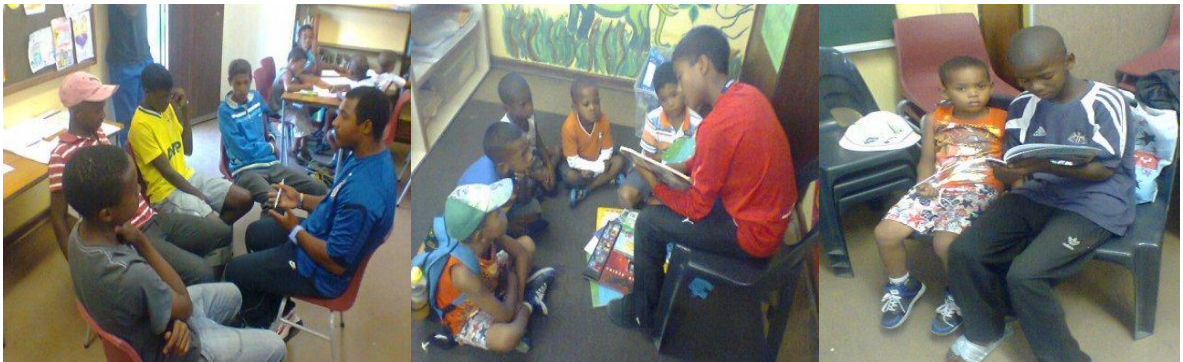
Two U/15 reading to the little ones.