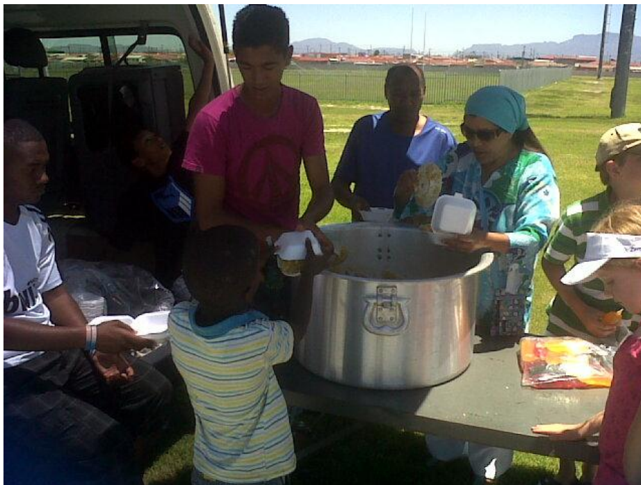
End of year feeding scheme , served 500 meals

They say that pictures tell a thousand words and I think you will agree that 2012 has truly got off to a great start. Our boys are responding well to the new structure we are enforcing and this can only help them grow and become the positive members of society we strive to achieve day to day. Sometimes it's difficult for me to put into words just how much of an impact we are having on our community, there are many things that happen on a daily basis that you have to see to believe. All that is left to say is thank you all again for your continued support to GCU and the communities.